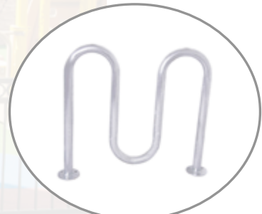
Surface Mount Bike Rack

Surface mounting involves bolting the item down into the flooring or surface substrate to secure in place. This method provides stability and also allows future removal or repositioning.